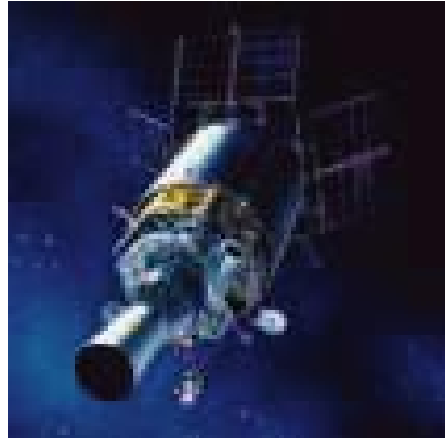
Defense Support Program satellites provide early warning of a missile attack.

Proper use of ISR assets is critical to the planning, conduct, and assessment of nuclear operations. ISR affords the commander the ability to gather information and make decisions in a timely fashion. Warning systems must be in place that allow civilian leaders to determine if a nuclear response is appropriate. Planners must have the means of finding decisive targets and determining the proper weapon to employ. Post-attack assessment of both friendly and enemy capabilities is essential for determining the need for and ability to conduct follow-on attacks.