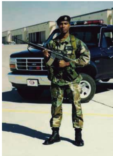
Proper security is essential for maintaining WSSRs.

WSSRs are implemented through a combination of mechanical means, security procedures, flying rules, and personnel programs. Different weapon systems will have different rules based on their capabilities. Storage and movement of weapons must also be consistent with WSSRs. Commanders and operators must follow applicable Air Force policies for their weapon system and must ensure that non-US personnel adhere to applicable Air Force and multinational requirements. One key component of WSSRs is that, while preventing the unauthorized use of nuclear weapons, they allow for timely employment when ordered. To this end, all personnel involved in the com-