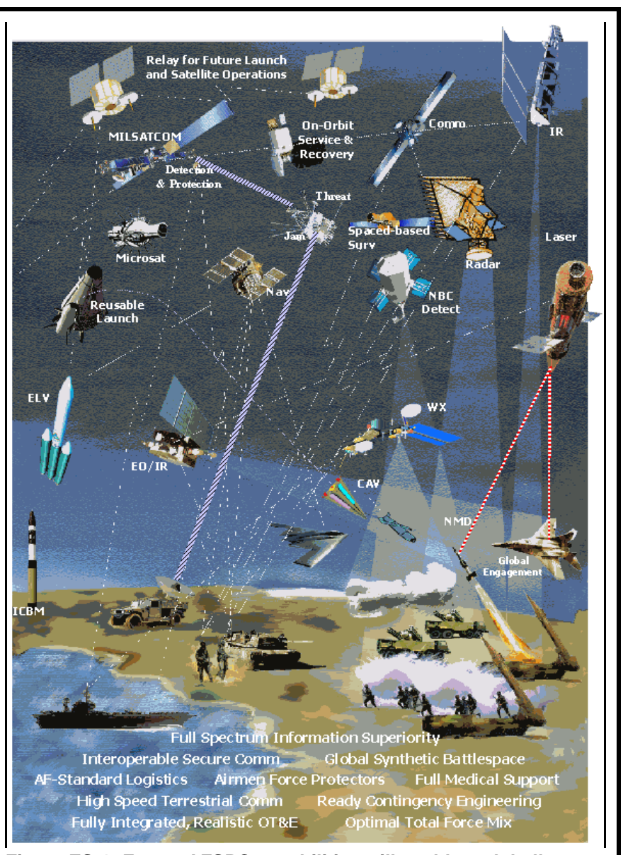
Figure ES-1: Future AFSPC capabilities will enable a globally integrated Aerospace Force capable of providing continuous deterrence and prompt engagement.

"Figure ES-1 visually depicts some of the key capabilities we will provide by the end of the 25-year planning period. Our future AFSPC capabilities will enable a fully integrated Aerospace Force to rapidly engage military forces worldwide. Our space forces will move beyond being primarily force multipliers to also being direct force providers. Global real-time, situational awareness will be provided to our combatant commanders through space-based Navigation, Satellite Communications (SATCOM), Environmental Monitoring (EM), Surveillance and Threat Warning (S&TW), Command and Control (C2), and Information Operations (IO) systems. Robust and responsive spacelift and improved satellite operations capabilities will provide on-demand space transportation and on-demand space asset operations ensuring our ability to access and operate in space. Full spectrum dominance in the space medium will be achieved through total space situational awareness, protection of friendly space assets, prevention of unauthorized use of those assets, negation of adversarial use of space and a fully-capable National Missile Defense (NMD). Our ICBMs will continue to provide a credible strategic deterrence, while advanced, conventional weapons operating in or through space will provide our National Command Authorities (NCA) with formidable